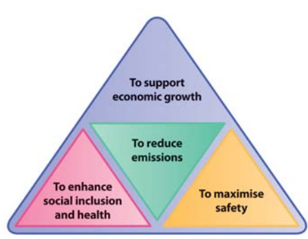
To keep people and goods moving effectively

Another key change is that from 2011 instead of being confined to South Yorkshire, we will be looking to the Sheffield City Region (SCR) instead. This includes the total travel to work area for the county and so takes in those conurbations which lie outside South Yorkshire in the neighbouring counties of Derbyshire and Nottinghamshire. These new responsibilities offer real opportunities to forge contacts with new stakeholders and to help establish better joined up services which meet the needs of the traveling public.