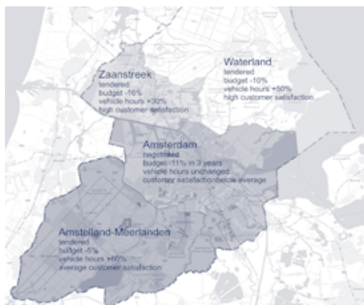
Public Transport Concessions in the Metropolitan Region of Amsterdam.